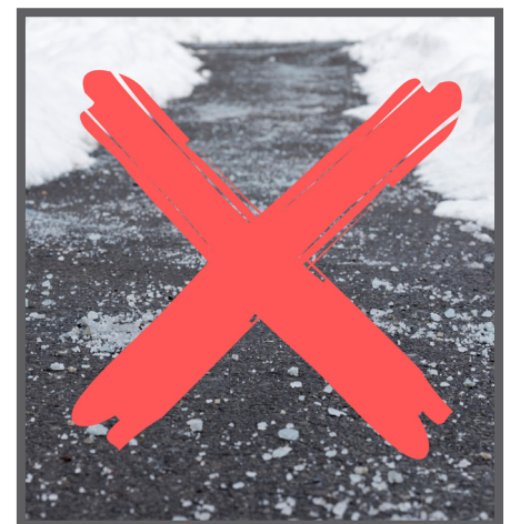
An example of over-applied salt. 1-2 inches between particles is usually sufficient.